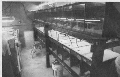
In its first year, Sea & Reef sold 407 fish bred in its marine lab in Maine. This year, that number has jumped to 14,000.