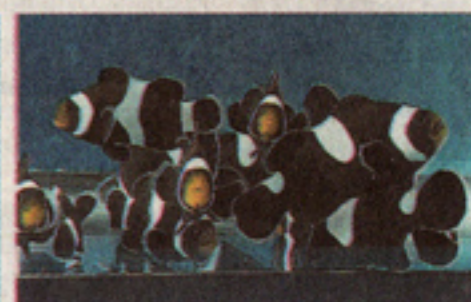
Sea & Reef, run by Soren Hansen (at top), is one of only a few marine labs whose tropical saltwater fish are grown from eggs produced in captivity, including the Maine Blizzard clown fish (far left), sea horses, Darwin Ocellaris clown fish (above), and neon dottybacks (below).